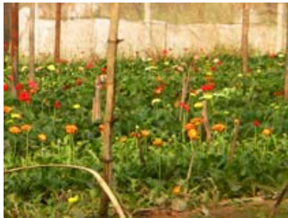
The owner provide the 200-300 stalks to the airport every days. There were so many flowers in the farm.