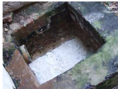
Drop EM from the ditch.