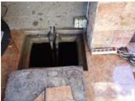
Alam kul kul A picture of septic tank