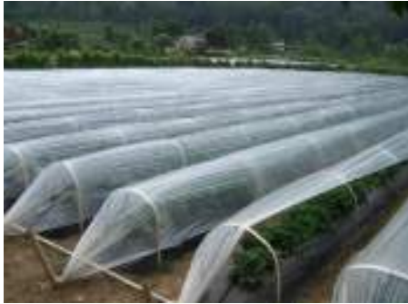
The strawberry farm

In Indonesia, over 30 hotels use EM for their sewage treatments. A majority of these projects are maintained by the team of Pak Oles. (Wididana san' s team)