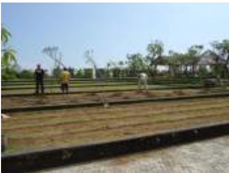
The fame which is in the Brahmavihara-Arama temple.