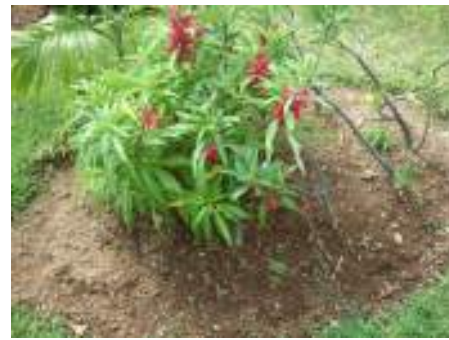
Ornamental plants (Brahmavihara-Arama)