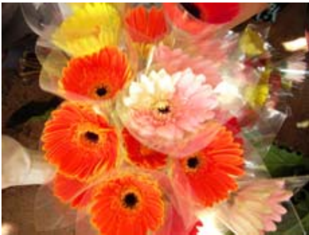
Beautiful Organic EM flowers.

The mode of using EM by this grower is as follows: A mixture of 3% EMAS and 3% molasses is added to a tank with 200 l of soybean liquid (prepared by mixing mashed soybeans with water). This liquid is applied to the soil until planting and thereafter at two week intervals. The flower stalks grow taller and colors brighter and the harvest of 200 – 300 stalks per day is sold at the Hanoi Airport and also used in decorations. The use of EM has removed offensive odors in the flower gardens.